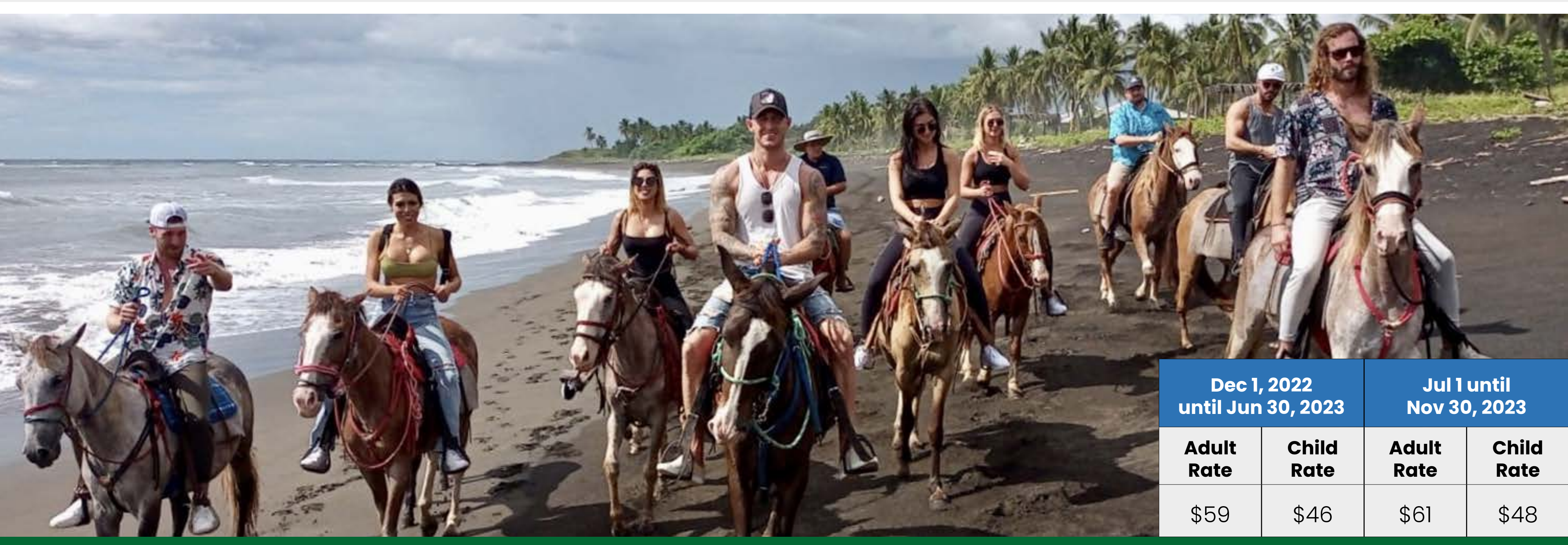
3 hours | Minimum 2 pax | Difficult

Includes: Snack, beverage, guide and transportation. What to bring: Mosquito repellent, sunscreen, hat and/or sunglasses, hiking shoes, camera. Children Rate Policies: Rates for children apply from 5 to 12 years old. Notes: Transportation may is not included from outside Samara area but available for an extra fee.