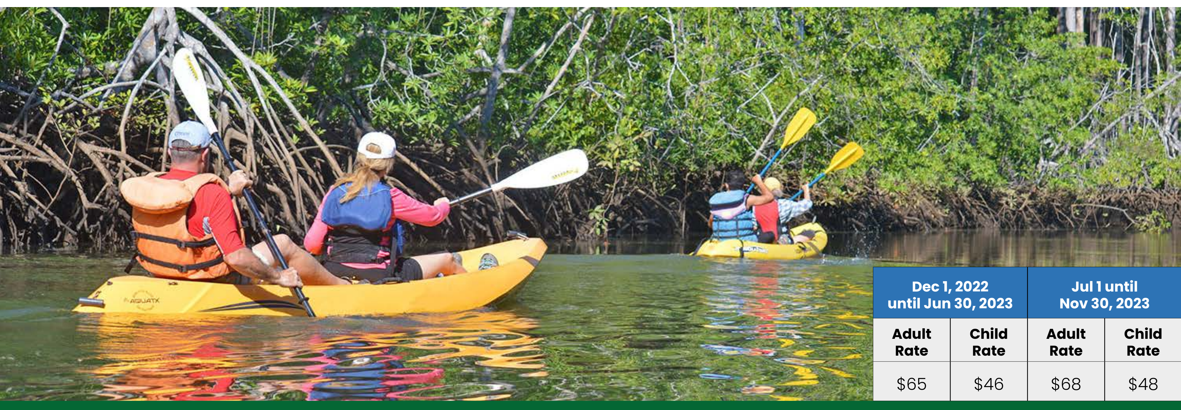
3 hours | Minimum 2 pax | Difficulty

Includes : Transportation, bilingual guide,Certified Boat Captain, Bottled water, juices, beers, and snacks. What to bring : Clothes to get wet, Water shoes, Sunscreen,Repellent, Hat & Sunglasses,Waterproof Camera. Children Rate Policies : Rates for children apply from 5 to 12 years old. Notes : Transportation may is not included from outside Samara area but available for an extra fee.