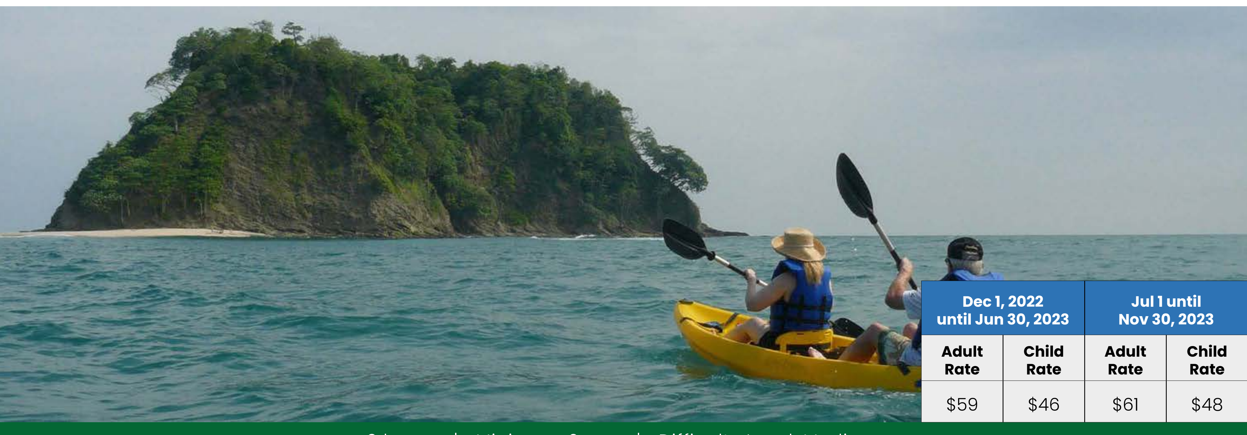
Minimum 2 pax 3 hours

Includes: Transportation, bilingual guide, snorkel equipment, fresh fruit, bottled water, Juice, beer, courtesy photograph (if conditions allow for photo taking).