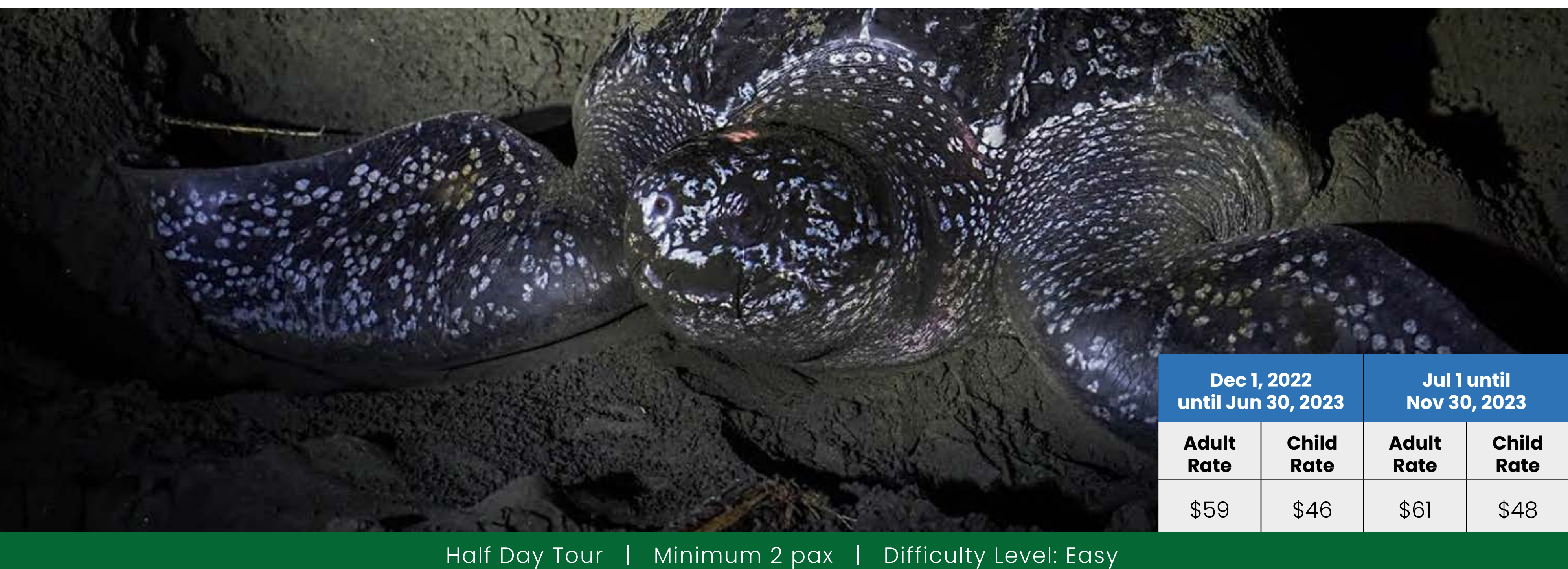
Half Day Tour Minimum 2 pax

Includes : Transportation, entrance fee, bilingual guide, bottled water, juice and snacks. What to bring: Hiking shoes or tennis shoes, dark clothing, insect repellent, raincoat (rainy season). Children Rate Policies : Rates for children apply from 5 to 12 years old. Notes: Transportation may is not included from outside Samara area but available for an extra fee.