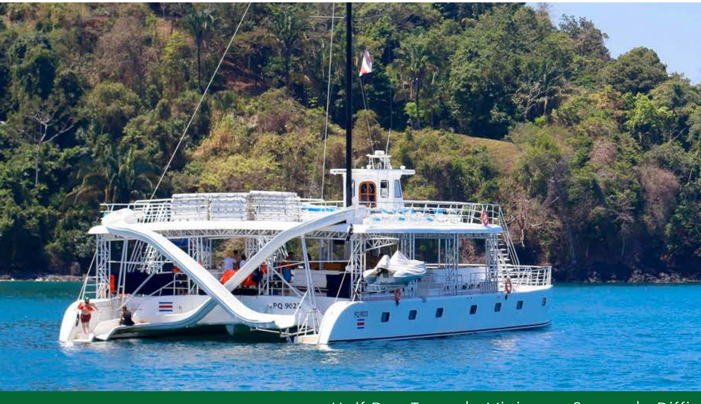
Half Day Tour | Minimum 2 pax | Diffic

Includes: Transportation, bilingual guide, snorkel equipment, bottled water, juices, and fresh fruits. What to bring: Shoes for water, swimsuit, towel, sunscreen, hat, camera. Children Rate Policies: Rates for children apply from 5 to 12 years old. Notes: Tour times depend on the high tide and will vary each day. Transportation may is not included from outside Samara area but available for an extra fee.